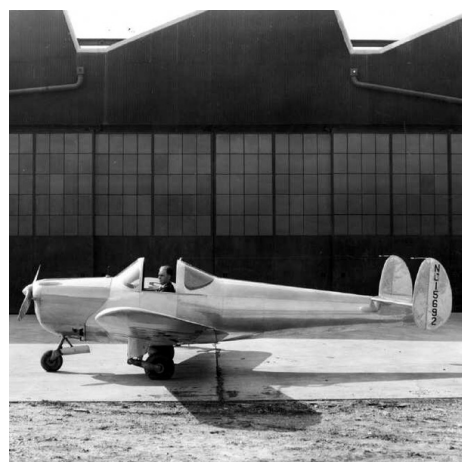
Top: One of NASA's spin-test aircraft, a Cessna 172 equipped with wing cuffs (in red on the leading edge of the outboard parts of the wing), in flight.

The FAA Part 23 spin-resistance standards require tests across the range of configurations and center-of-gravity (CG) locations that the aircraft will fly with, and the tests become progressively more difficult as the CG moves aft. For each configuration, the aircraft must successfully complete five different maneuvers ranging from a relatively mild wings level or coordinated turning stall to an aggressive abused input (uncoordinated with full deflection of elevator, full rudder, and full aileron input opposite to rudder), which must be held for seven seconds without a spin initiating. With all configurations and permutations, the A5 was subjected to over 360 test cases.